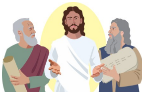
JESUS IS TRANSFIGURED